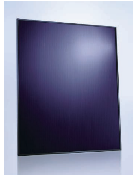
SCHOTT ASI™ 78/81/86/89